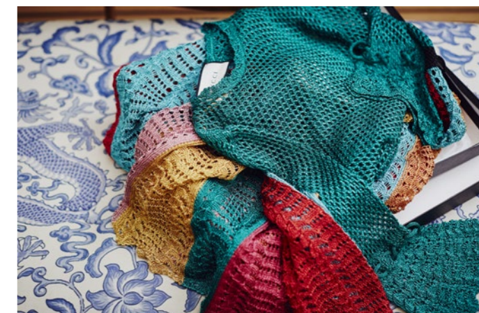
Natasha's London hotspots : 1. Dover Street Market (london.doverstreetmarket.com): 'The new store on Haymarket looks amazing. They know exactly what I like.'