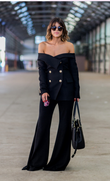
Buy your blazer a couple of sizes too big like blogger Marissa Karagiorgos and play with your proportions.